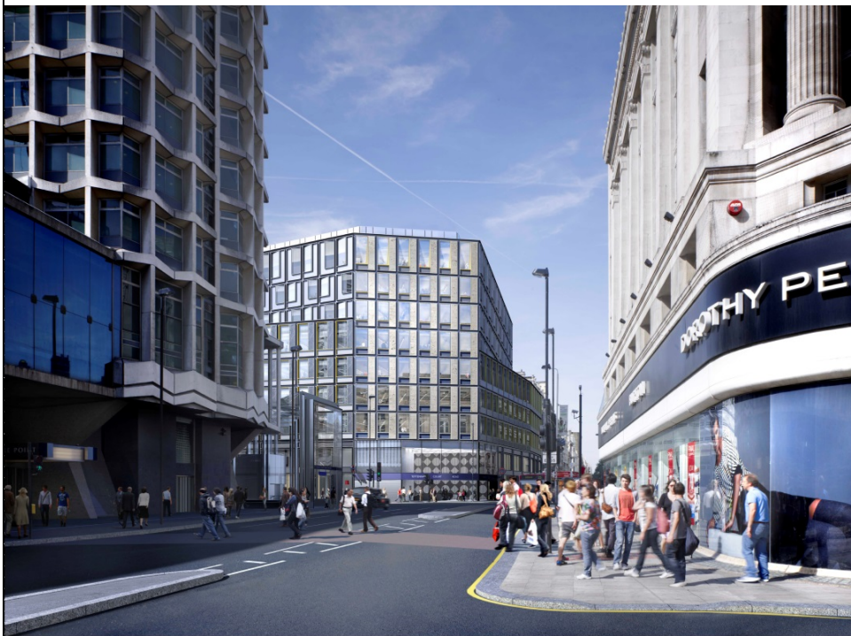
Site A – As approved (January 2016)