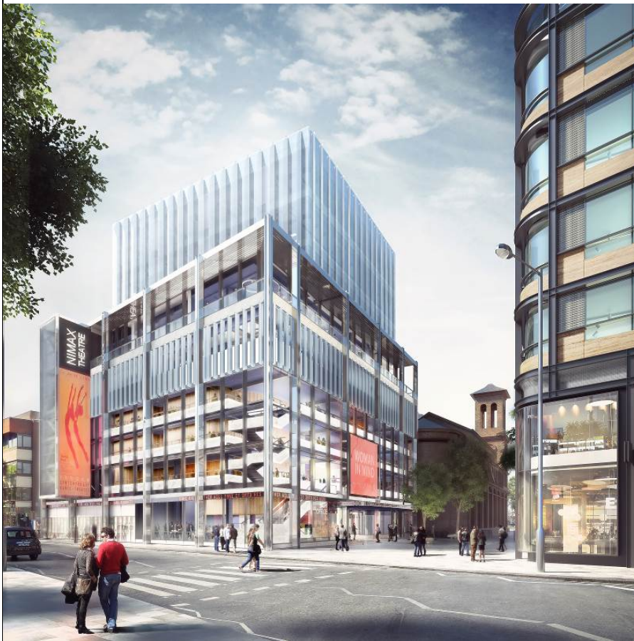
Site B – As proposed.