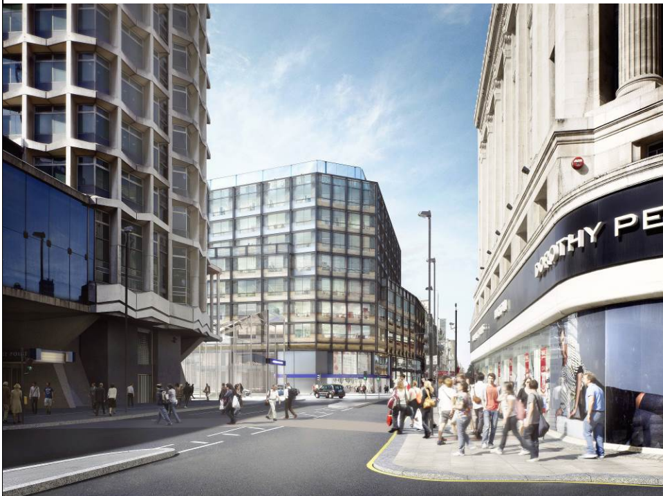
Site A – As proposed.